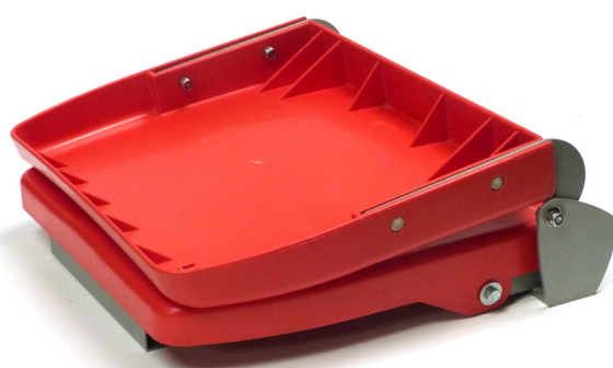
S 96 FG