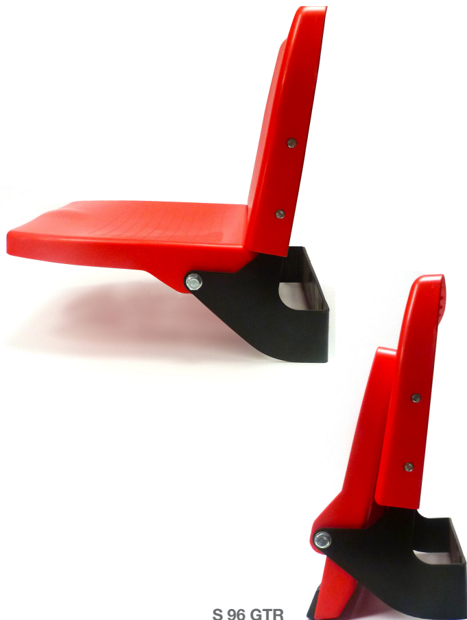
S 96 GTR